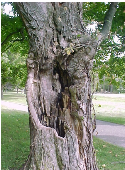
This tree near a sidewalk endangers those passing by.

Americans spend billions of dollars annually on their lawns and gardens. When you need to know the value of a tree, whether for litigation purposes or for preconstruction planning , give us a call.