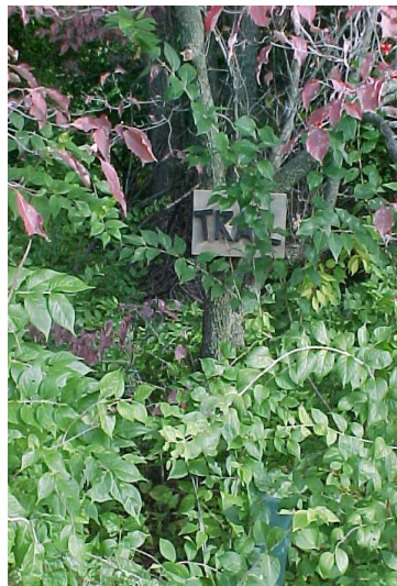
Create unique trails to enjoy and learn about nature's beauty.