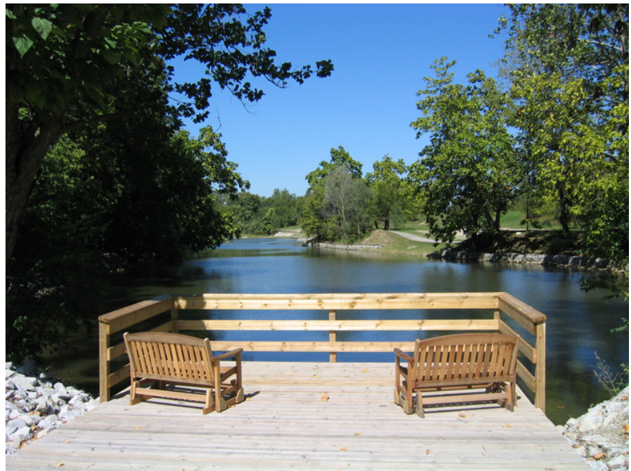
National Arbor Day Foundation Building With Trees Award Winner

T he staff at Vine & Branch is pleased to be of service to you. Our team includes a Registered Consulting Arborist, a Registered Landscape Architect, seven Certified Arborists, an Indiana Master Horticulturist, and three Licensed Plant Healthcare Specialists all ready to provide their expertise.