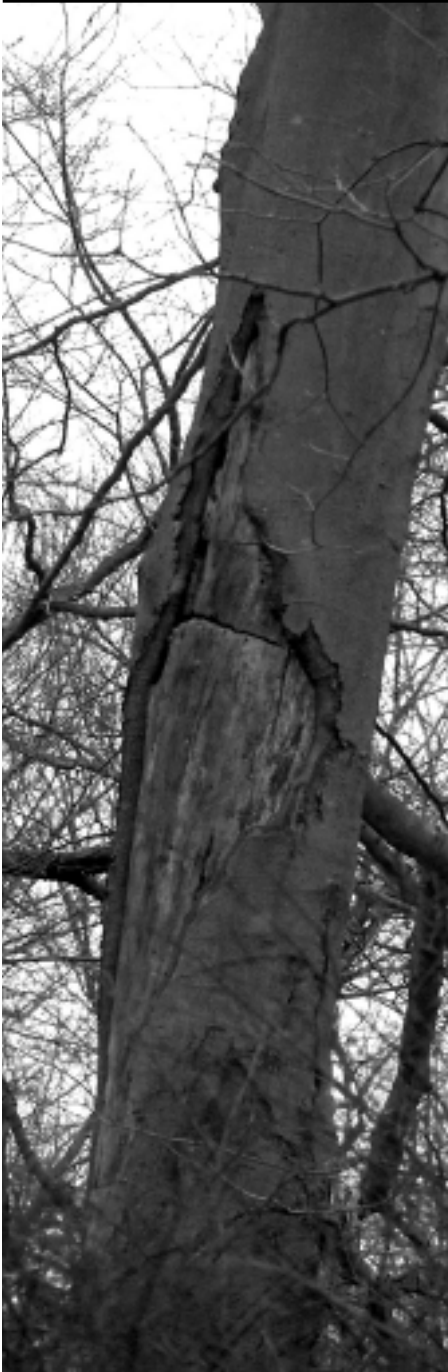
Cross-grain cracks are due to fail.

Trees are much like human teeth; as teeth rely on enamel, trees rely on bark for protection. Trees often are damaged during construction and development, which leads to trees becoming weak as they decay and tries to compartmentalize the decay. The process that trees go through in reaction to a wound is called Compartmental-