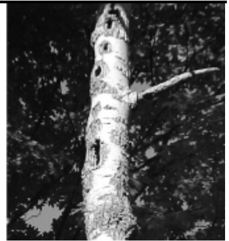
The presence of woodpecker holes may be a telltale sign of other problems.